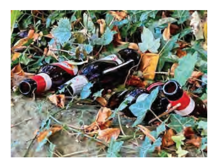
Sent from my iPhone